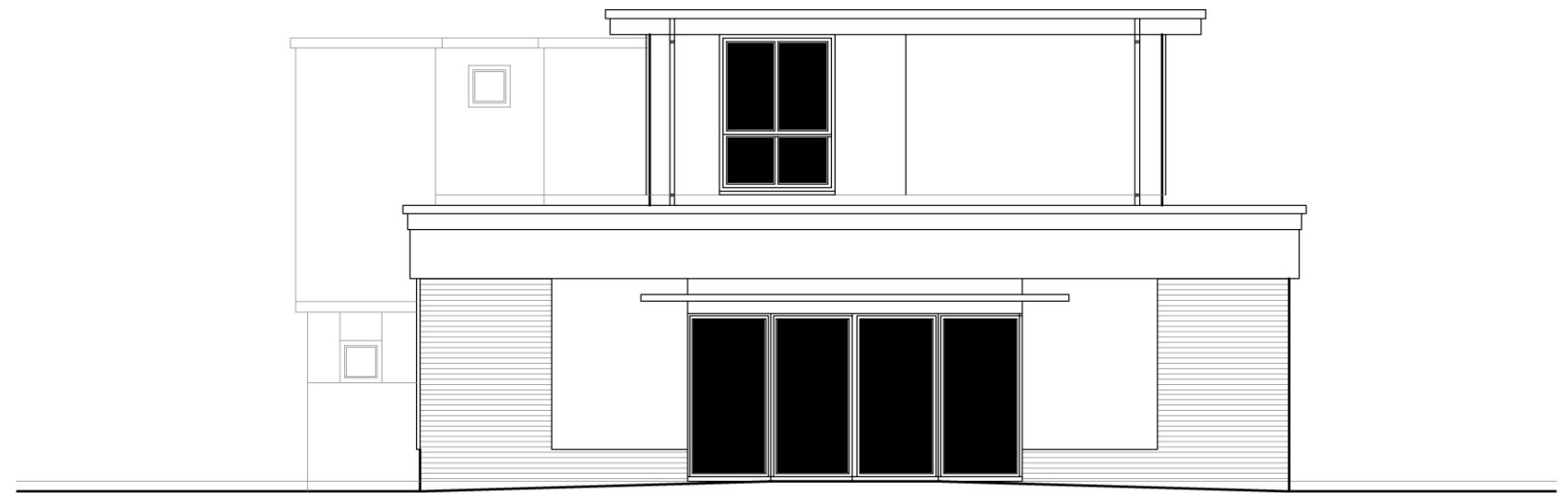
RETAIL UNIT PROPOSED SOUTH EAST FACING ELEVATION 1:100

Proposal for new apartments and metro supermarket